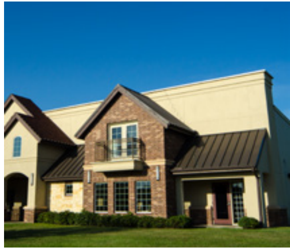
Pet Resort | Building Project