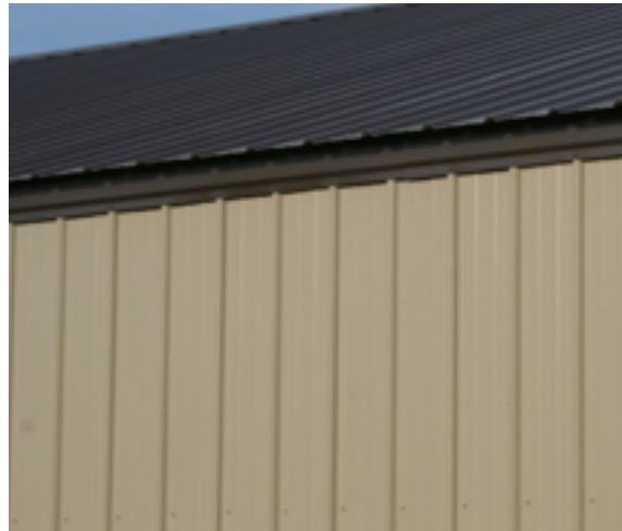
Barn | Building Project