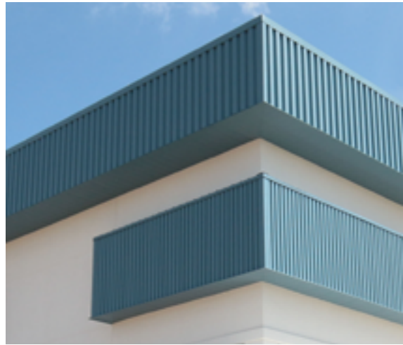
Training Facility | Building Project