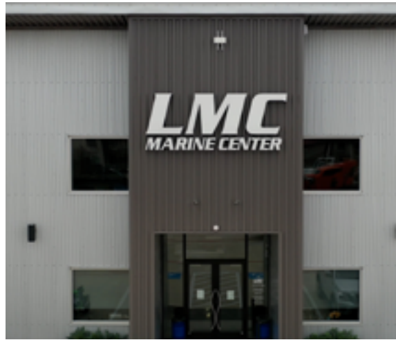
Marine Center | Building Project