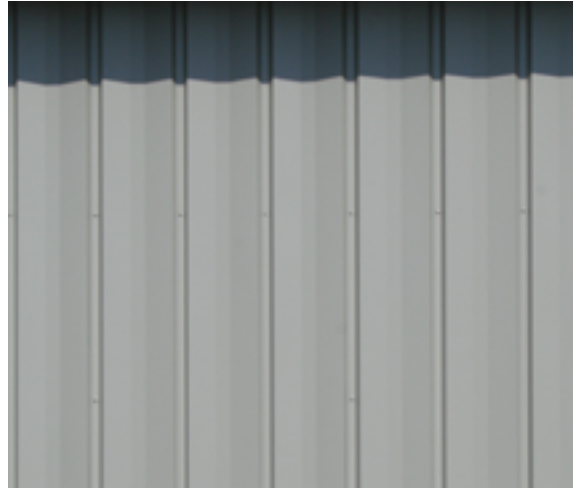
Church | Building Project