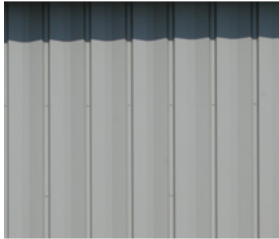
Church | Building Project