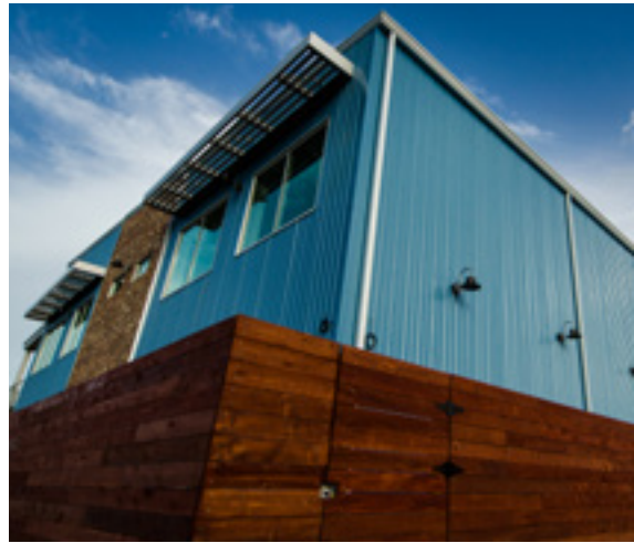
Brewery | Building Project