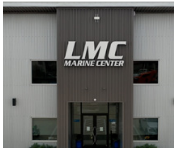
Marine Center | Building Project